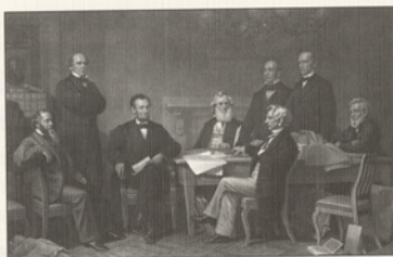
THE FIRST READING OF THE EMANCIPATION PROCLAMATION BEFORE THE CABINET, 1866.

by Alexander Hay Ritchie after painting by Francis Bicknell Carpenter U.S. Senate Collection