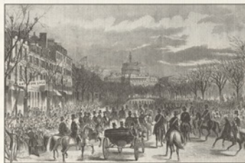
ABRAHAM LINCOLN ON PENNSYLVANIA AVENUE ON HIS WAY TO THE CAPITOL TO BE INAUGURATED, 1861. FRANK LESLIE'S ILLUSTRATED NEWSPAPER, 03/16/1861

Called upon to lead the nation at its most divisive moment, Lincoln sought to unite people by appealing to their "better angels." He denied the inevitability of war and called for caution and patience. Above all, Lincoln hoped for peaceful resolution and common purpose, insisting, "We are not enemies, but friends." The President delivered his address in a voice that observers said "rang out over the acres of people before him with surprising distinctness, and was heard in the remotest parts of his audience." His first inaugural address concluded with an evocative image: "The mystic chords of memory, stretching from every battlefield and patriot grave to every living heart and hearthstone all over this broad land, will yet swell the chorus of the Union, when again touched, as surely they will be, by the better angels of our nature."