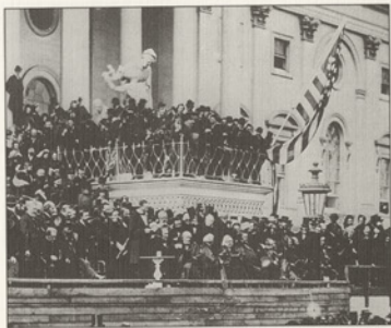
ABRAHAM LINCOLN DELIVERING HIS SECOND INAUGURAL ADDRESS, 1865.

Since Lincoln's time, the Presidential Inauguration has undergone significant alterations. The Twentieth Amendment to the Constitution, ratified in 1933, changed the date of the ceremony from March 4 to January 20, thereby reducing the span of time between a President's election and the commencement of the new administration. In January 1981, Congress moved the inaugural ceremonies to the Capitol's West Front, where the broad terraces serve as the inaugural platform, and where much larger space is available for the public to view the proceedings. The event is broadcast and digitally streamed across the nation and around the world. Despite such changes, the inaugural ceremonies continue to bring together the three branches of the federal government, with the magnificent backdrop of the gleaming white Capitol dome, for an event that represents the purposes and ideals that Abraham Lincoln so often expressed, for national renewal, continuity, and unity.