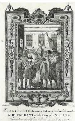
Print, "The manner in which the American colonies declared themselves independant [sic] of the King of England, throughout the different provinces, on July 4, 1776"

Writing in support of the Constitution, Alexander Hamilton emphasized the revolutionary concept at the heart of the proposal. "The whole power of the proposed government is to be in the hands of the representatives of the people. This is the essential, and, after all, the only efficacious security for the rights and privileges of the people." James Wilson, who had signed the Declaration of Independence and served as a Pennsylvania delegate to the Constitutional Convention, echoed Hamilton's sentiments. He extolled the brilliance of the Constitution's "great principle"—an idea that Wilson observed had also been at the heart of the Declaration of Independence—that "the supreme power resides ... in the people, as the fountain of government."