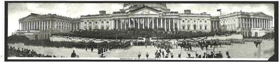
Panoramic postcard showing soldiers and crowds at the east portico of the U.S. Capitol for the inauguration of President Theodore Roosevelt, March 4, 1905.

An early test of the nation's resolve occurred after the bitterly contentious election of 1800. Thomas Jefferson sought to refocus a divided nation on our constitutional foundation and the rights of all Americans that our