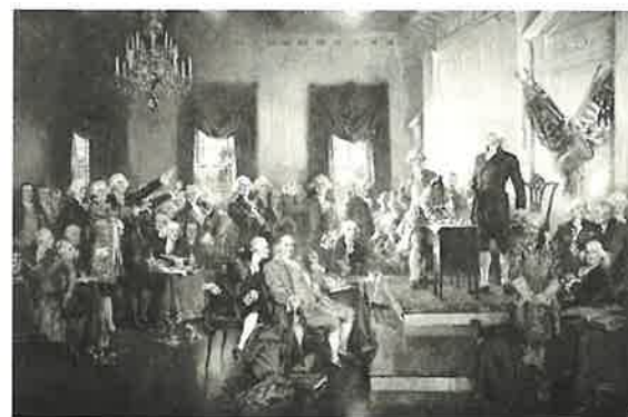
Signing of the Constitution, by Howard Chandler Christy

The Constitution was truly a revolution in governance, joining the rule of law with individual liberty. "Our Founding Fathers, faced with perils we can scarcely imagine, drafted a charter to assure the rule of law and the rights of man, a charter expanded by the blood of generations,"