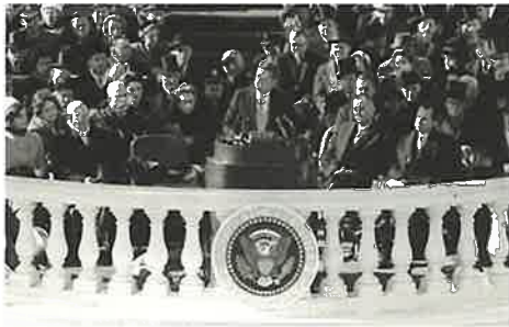
Inaugural Address of John F. Kennedy, January 1961.

At the end of the 20th century, the information revolution propelled the ideals of democracy and self-determination to all corners of the world. The United States had helped to hasten the fall of the Iron Curtain and end the Cold War, and President William Jefferson Clinton took comfort in the promise that our system of self-government offered for future generations. In his first inaugural address in 1993 he pronounced, "Our Founders saw themselves in the light of posterity. ... Posterity is the world to come; the world for whom we hold our ideals, from whom we have borrowed our planet, and to whom we bear sacred responsibility."